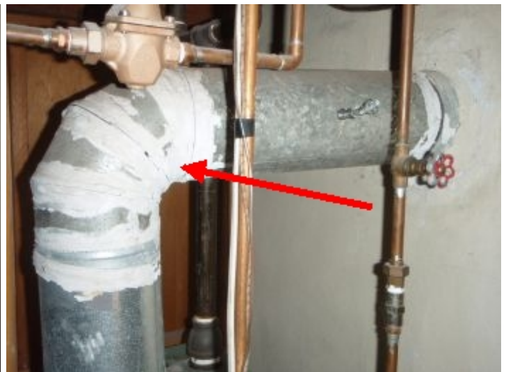
Possible Asbestos Containing Material on Vent Pipe