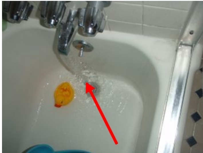
Tub Finish is Deteriorating