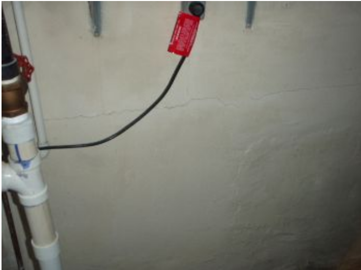
Horizontal Cracking Noted in Foundation Wall