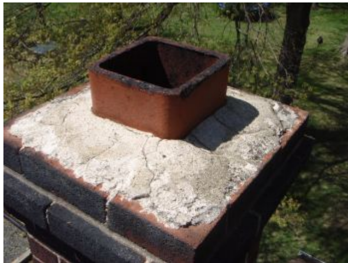
Soot Staining on the Chimney and Flue