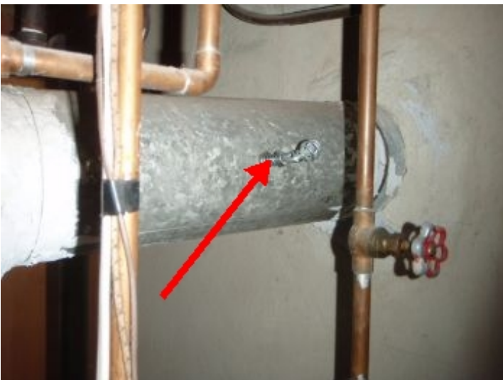
Improper Damper Installed at Boiler Vent Pipe