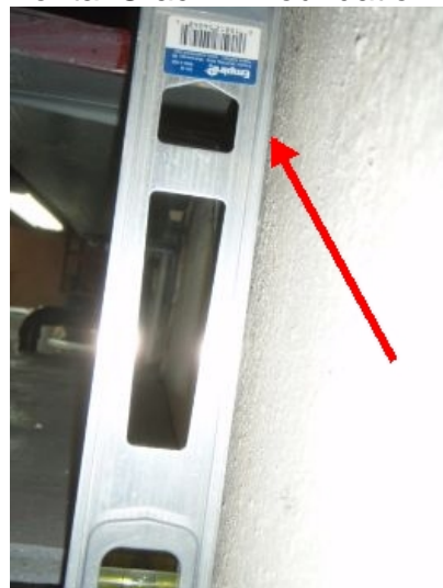
Bulging Foundation Wall