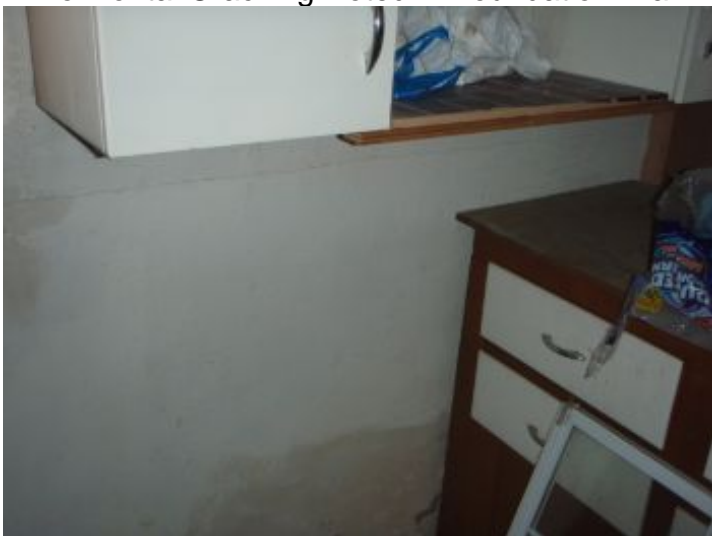
Horizontal Crack in Foundation Wall