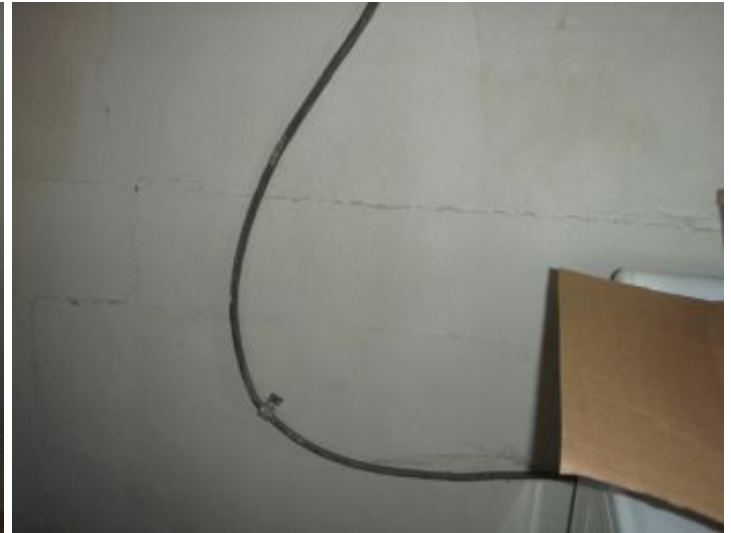
Horizontal Crack in Foundation Wall