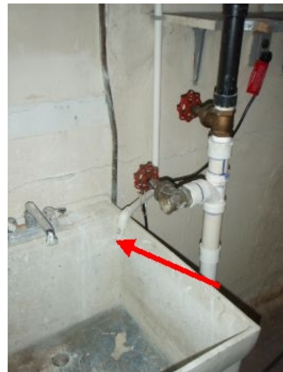
Possible Cross Connection - No Air Gap Between Backwash and Drainpipe